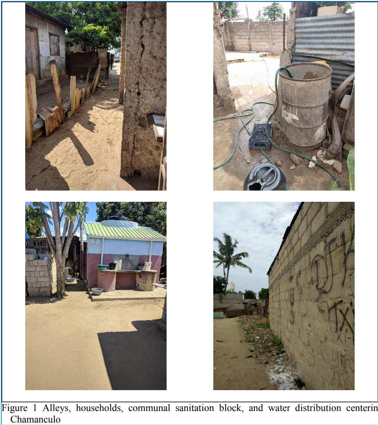
Figure 1 Alleys, households, communal sanitation block, and water distribution center in Chamanculo