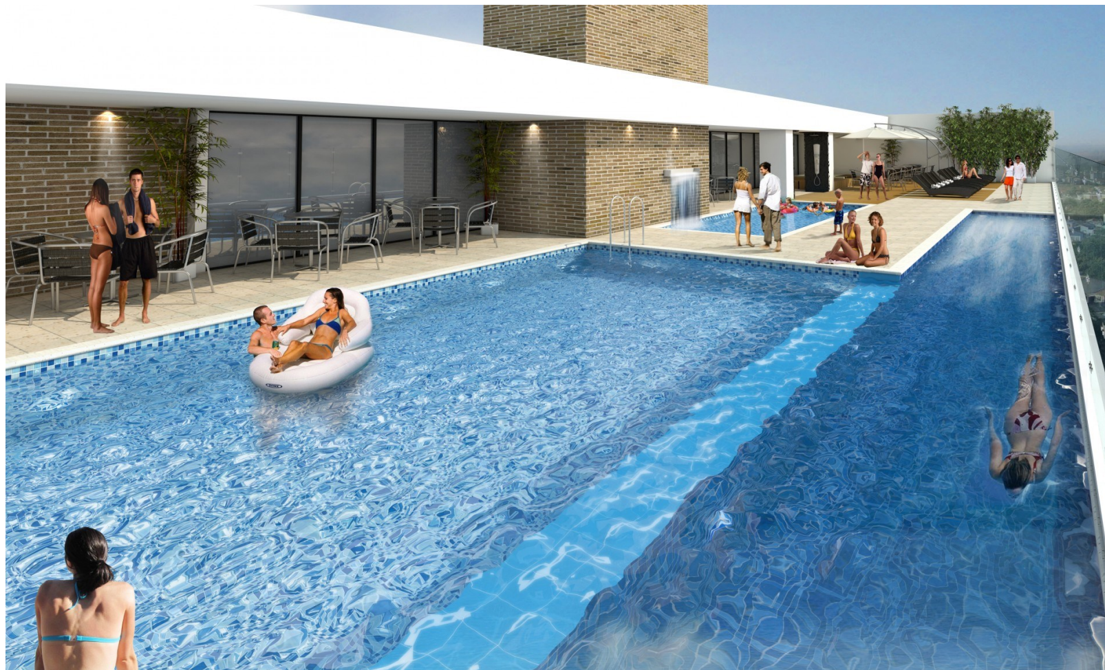
Áreas de piscina e spa Conjunto fechado, Barranquilla (Colombia) http://inacar.com/ciudad/