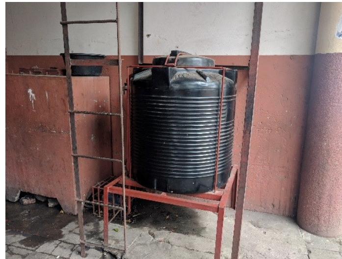
Figure 1 Water-storing tools in Maputo city