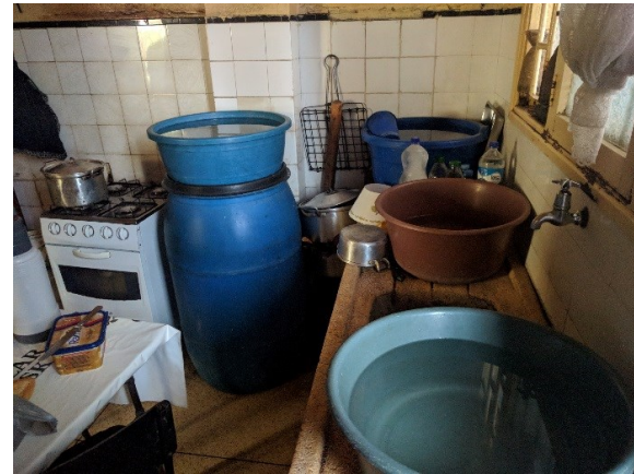
Figure 1 Façades, tanks, meters and kitchen in Alto Maé