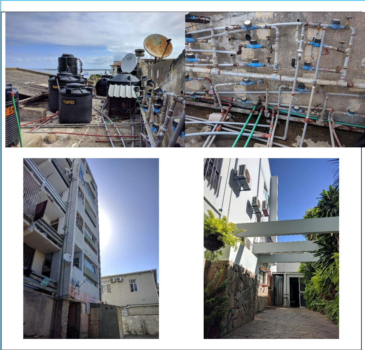
Figure 1 Tanks, meters, buildings and garage in Polana cemento