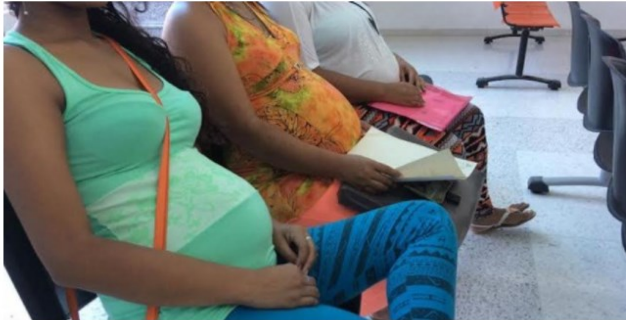
Las mujeres atendidas en Barranquilla que presenten posibles casos de zika tendrán atención prioritaria.