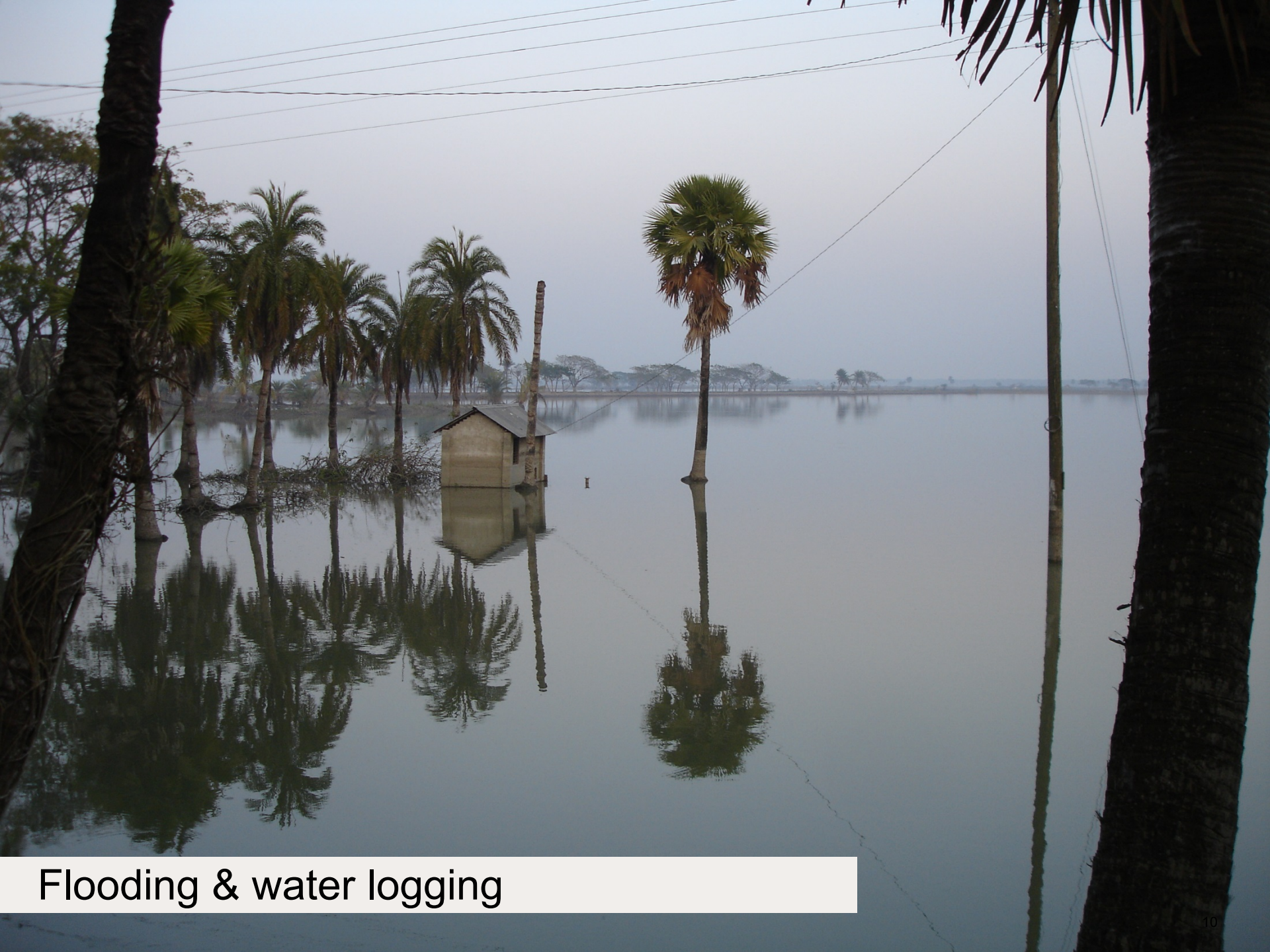
Flooding & water logging