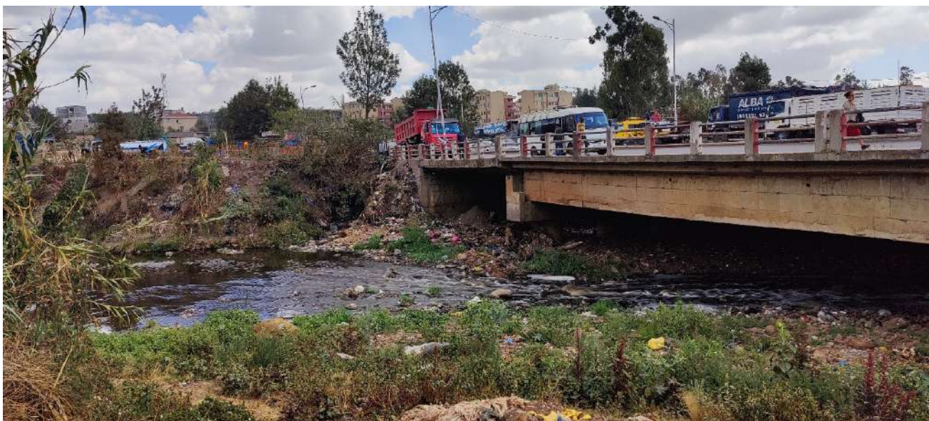
Bridge in Addis Ababa covered with debris and flood deposited silt, Ethiopia