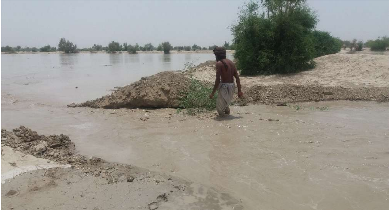
Closing the bund after the field has filled with spate water in Sindh, Pakistan

Effective flood management depends on strong coordination. We build this across communities and all actors, ensuring preparedness and resilience are continuously assessed and strengthened across flood risk awareness, infrastructure, communication, and social cohesion. GIS and remote sensing-based analysis, village and hazard mapping, participatory surveys, and scoring systems give decision-makers the evidence they need to act.