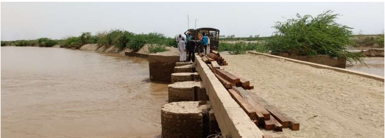
Flood management structure in the Gash spate irrigation system, Sudan

We ensure continuity of protection across all disaster phases, from pre-flood preparedness and emergency response coordination to post-flood recovery. Feasibility studies, hydrological and hydraulic assessments, risk analysis, institutional strengthening, and adaptive management combine to safeguard critical infrastructure and livelihoods over the long term.