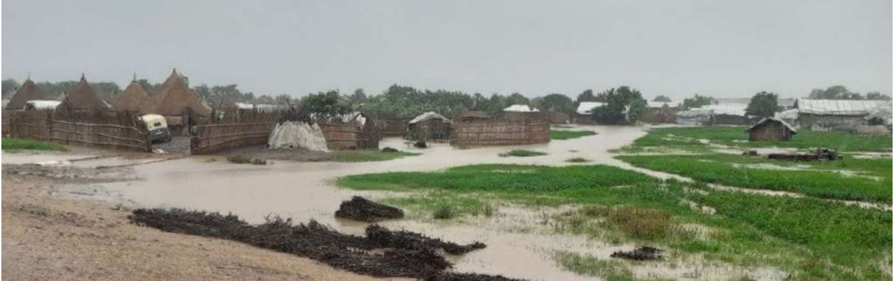
Flooded village in Fogera, Amhara

Floods are among the most destructive and frequent natural hazards in the world, yet they also carry enormous potential as a resource. GOPA MetaMeta works at this intersection: turning flood risk into resilience, and floodwater into opportunity.