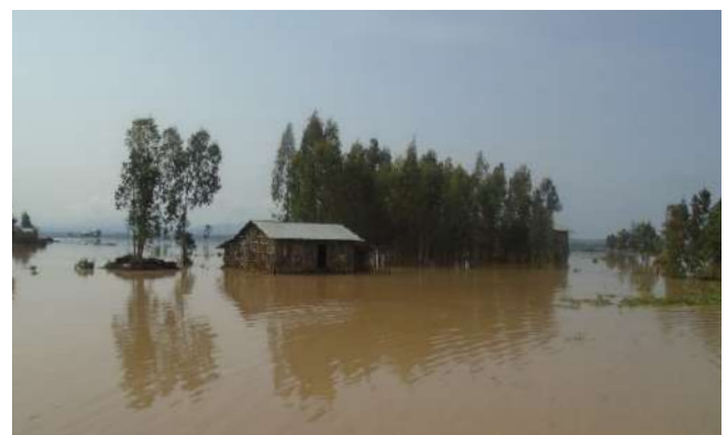
Flooded village in Fogera, Amhara