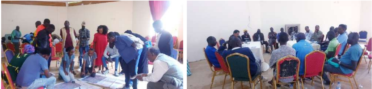
Discussing flood preparedness with the community in Atbara, Sudan

To link community preparedness with system-level resilience, we apply the Reuse, Retain and Reduce, and Remove framework. This provides a structured approach to evaluate and plan interventions across basins and communities, connecting local preparedness with system-wide interventions to ensure communities can anticipate floods, optimise water use, and strengthen recovery capacity.