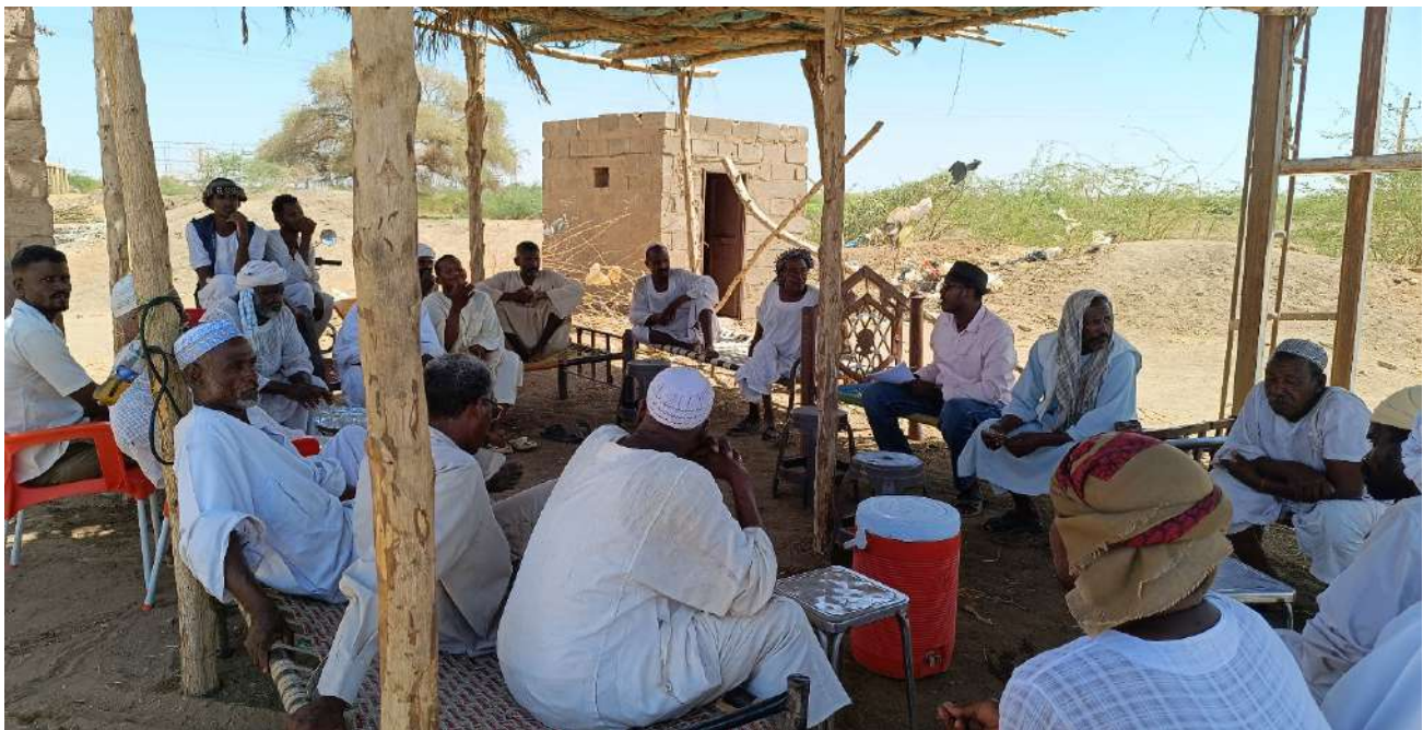
Flood-prone area mapping exercise and flood risk assessment with communities and experts in Gambela, Ethiopia

From rapid field assessments to basin-scale strategies, and from community preparedness to institutional reform, GOPA MetaMeta delivers flood risk management that links local action to system-level resilience, technically sound, locally grounded, and built to last.