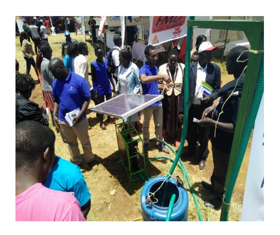
Solar pump by Future Pump Ltd. Eldoret, Kenya Trade Fair